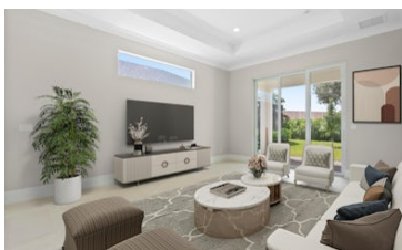
Included Lighting Package