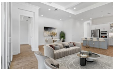
Included Lighting Package